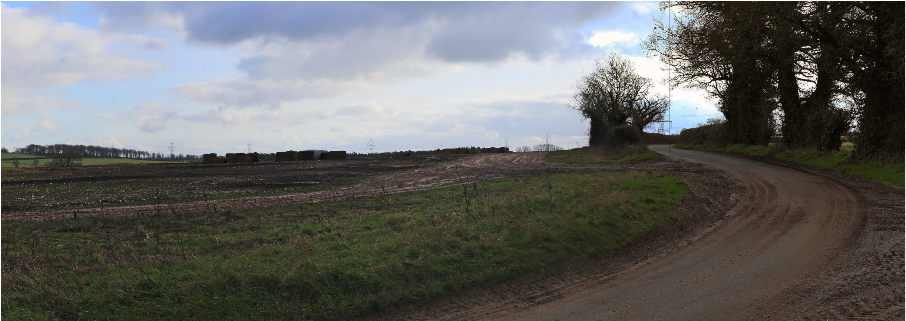
Representative Viewpoint 7 - South Acre Road and Peddars Way and Norfolk Coastal Path