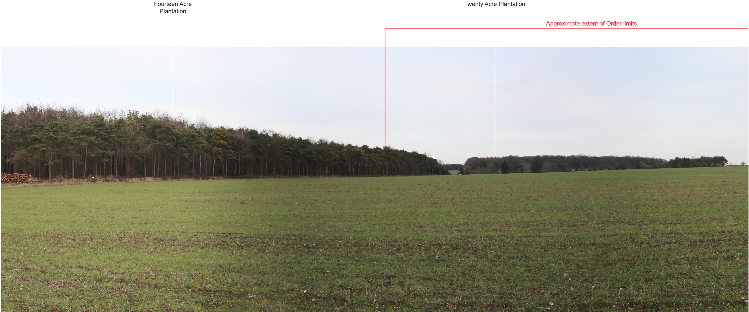
Representative Viewpoint 11 - PRow Narford RB1, Narford

Z:\9485_Kings_Lynn_Solar_Farm\docs\LV\AES\Winter_Photopanels\9485Fig6.10_PP_11.indd