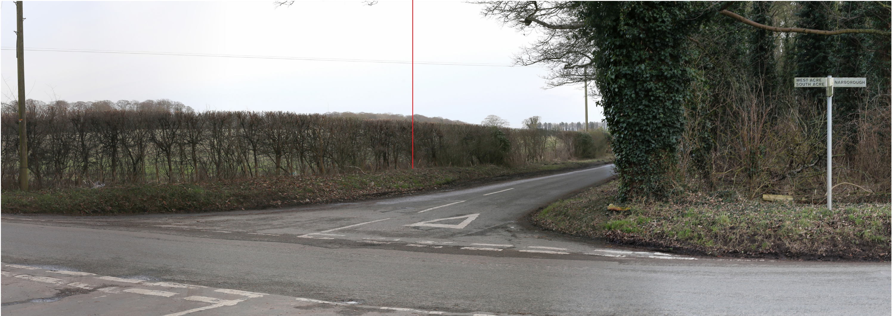
Representative Viewpoint 10 - Narford Lane, Narford

Existing View - This view is representative of road users along Narford Lane, adjacent to Narford Hall registered park and garden. The Site is not visible from this locality due to the intervening hedgerow in the foreground and wooded backdrop situated upon rising ground to the south, Twenty Acre Plantation and Three Sisters Plantation are visible on the skyline, with the Site situated beyond.