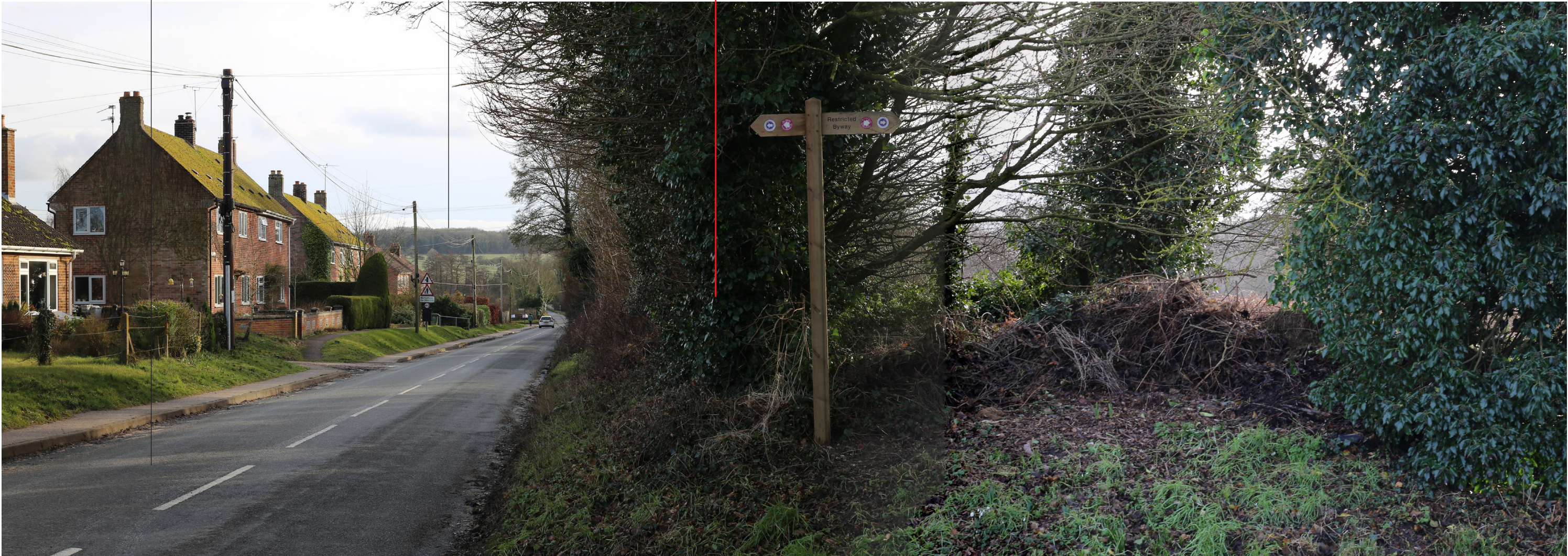
Representative Viewpoint 9 - River Road, West Acre

Existing View - This view is representative of PRoW users along the Nar Valley Way and road users along River Road. Eight Acre Plantation is visible on the skyline alongside existing development within West Acre. The Site is barely perceptible from this location due to the wooded context of the Site, which restricts views further southwards. Field boundary vegetation is visible upon rising ground to the south.