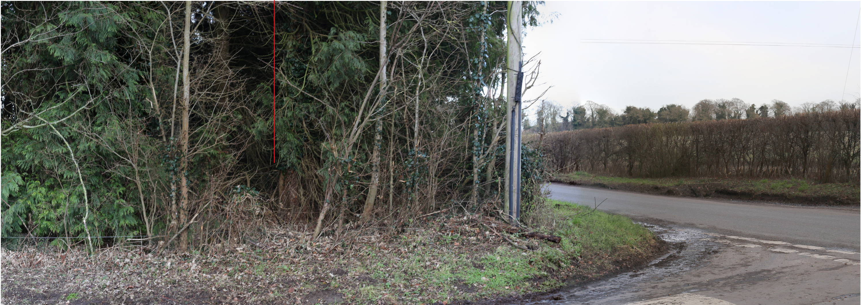
Representative Viewpoint 10 - Narford Lane, Narford