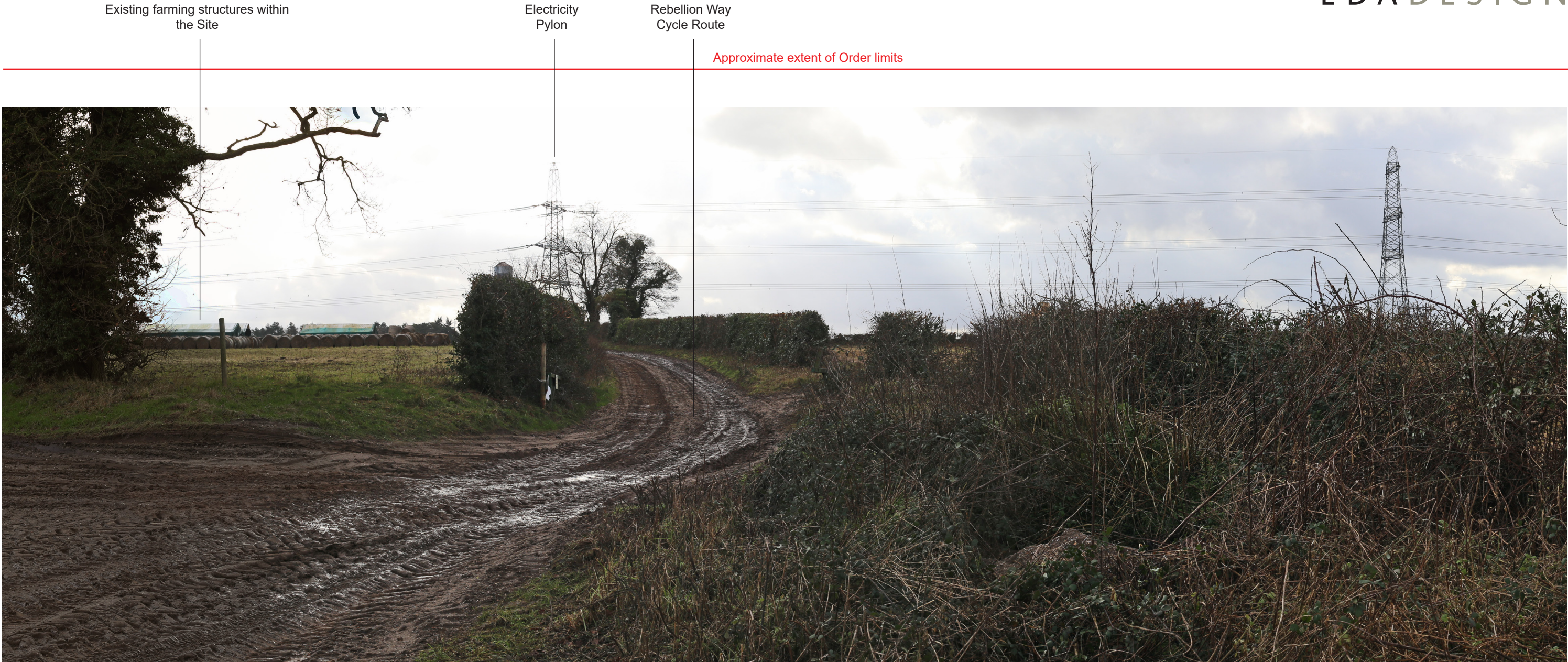
Representative Viewpoint 7 - South Acre Road and Peddars Way and Norfolk Coastal Path