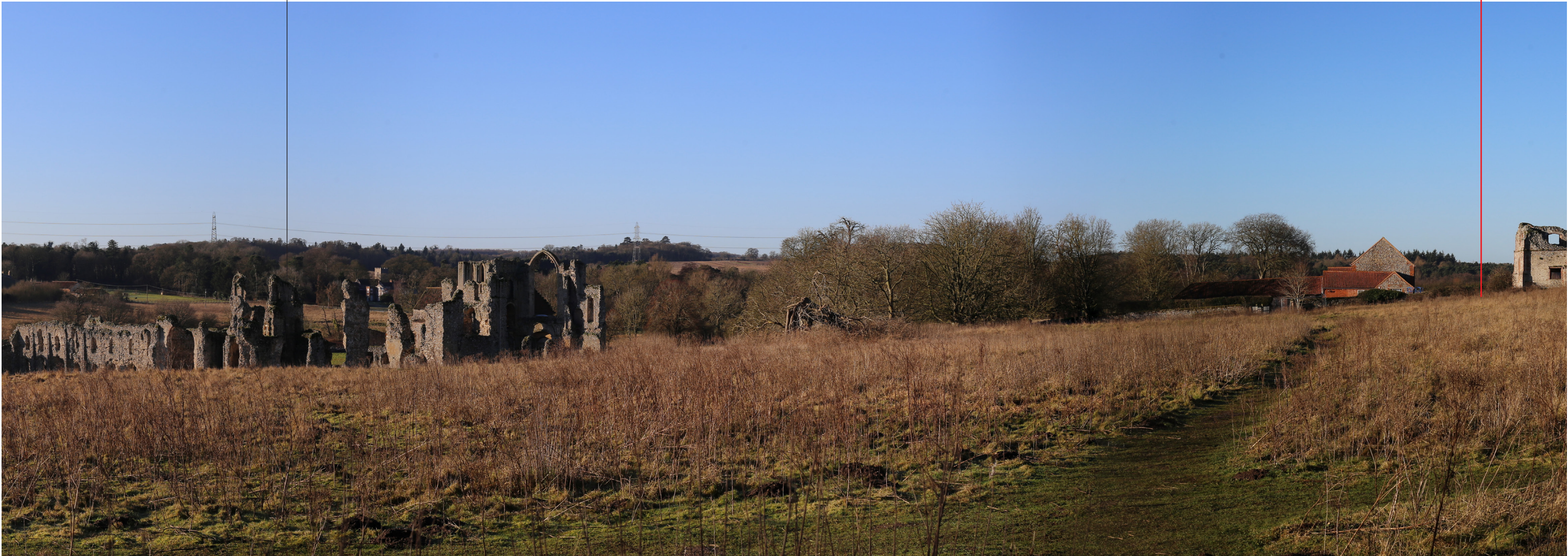
Representative Viewpoint 12 - Castle Acre Priory, Castle Acre

Existing View - This view is representative of visitors to Castle Acre Priory and users of permissive routes connecting to South Acre Road. There are filtered mid-ground views towards the Site. The Priory is clearly visible in the foreground set against a backdrop comprising a well wooded skyline with overhead transmission lines rising up from the trees. Existing wind turbines are also visible on the skyline. South Acre Hall is partially visible in the valley, with land rising again to the south towards the Site. Bartholomew’s Hills Plantation is visible on the skyline as a large woodland block.