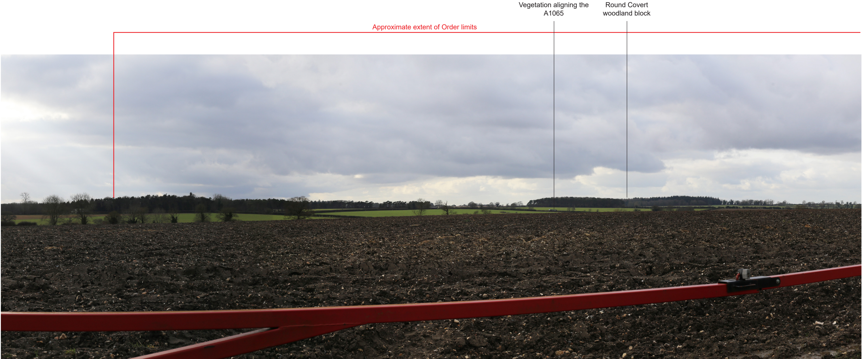
Representative Viewpoint 8 - South Acre Road and Peddars Way and Norfolk Coastal Path

Z:\9485_Kings_Lynn_Solar_Farm\docs\LV\AES\Winter_Photo\panels\9485Fig6-10_PP_8.indd