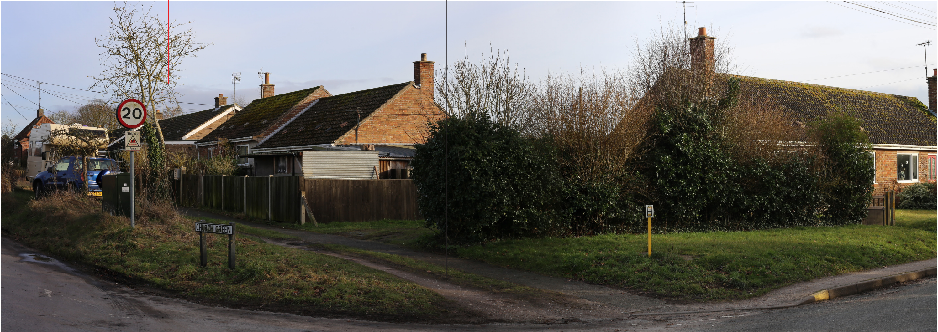
Representative Viewpoint 9 - River Road, West Acre

ISSUED BY Peterborough t: 01733 310471 DATE Nov 2025 DRAWN MSo SCALE@A3 NTS CHECKED OWh/MB STATUS Final APPROVED RP