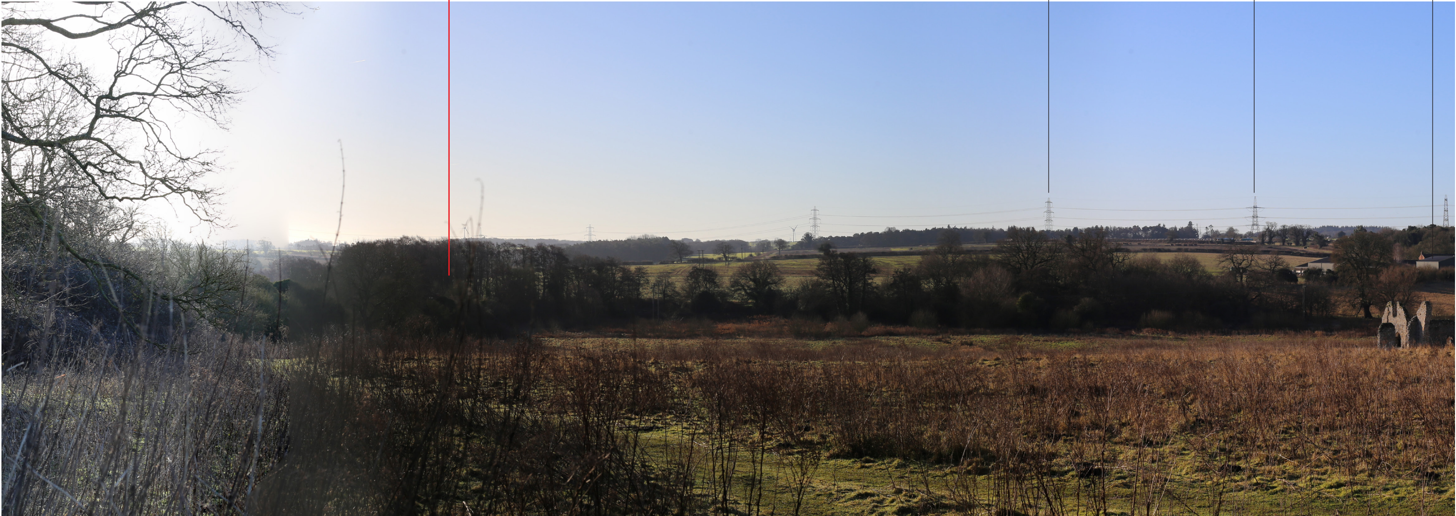
Representative Viewpoint 12 - Castle Acre Priory, Castle Acre

Pylon and overhead lines along the northern Site Boundary Pylon and overhead lines along the northern Site Boundary South Acre Hall