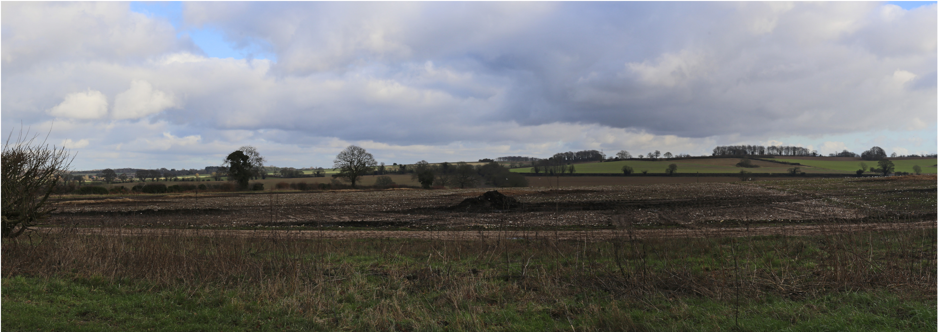
Representative Viewpoint 7 - South Acre Road and Peddars Way and Norfolk Coastal Path