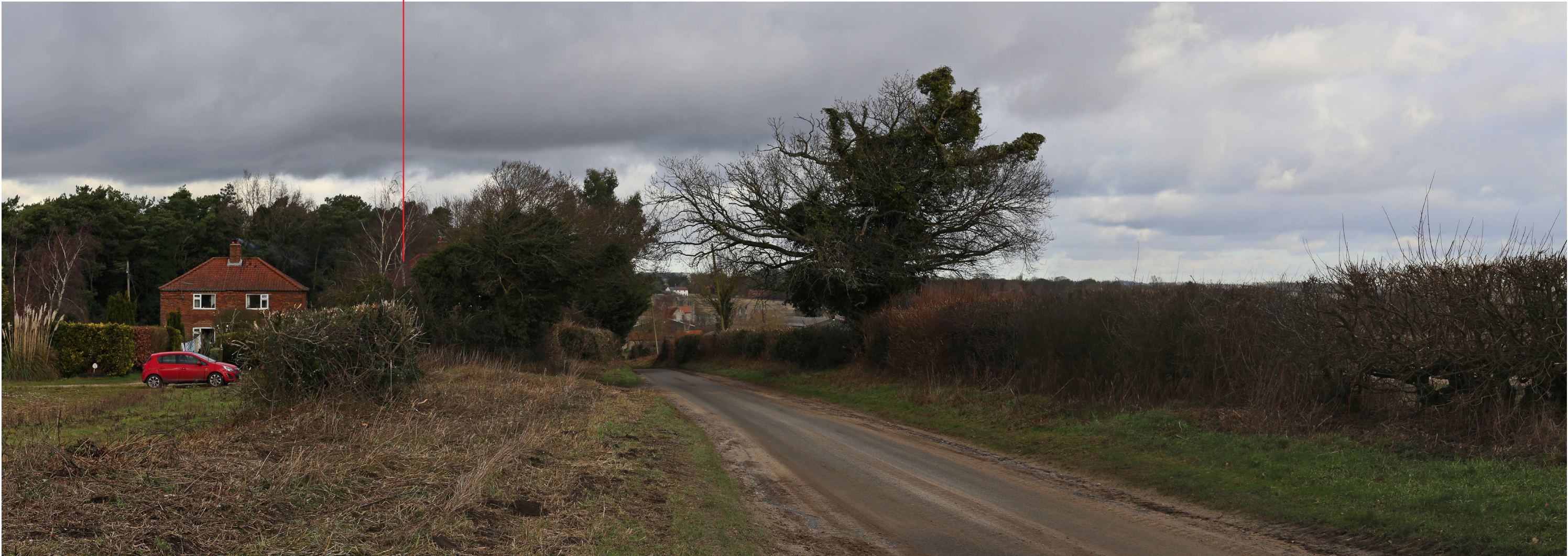
Representative Viewpoint 7 - South Acre Road and Peddars Way and Norfolk Coastal Path