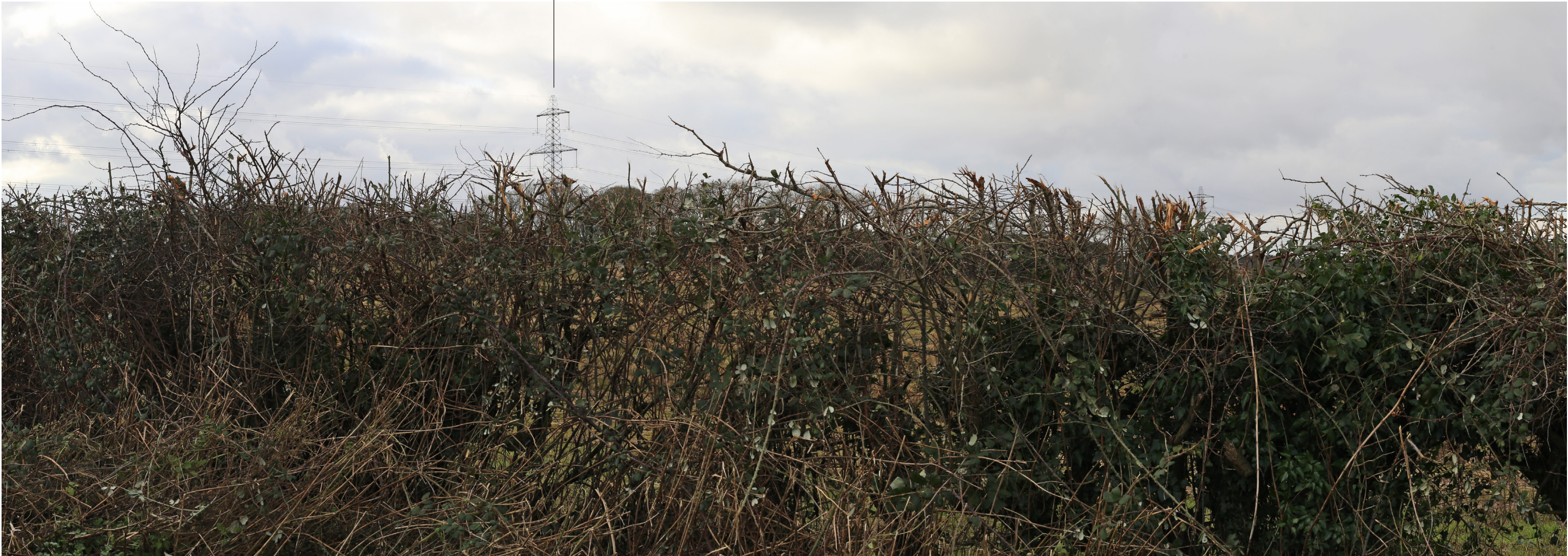
Representative Viewpoint 7 - South Acre Road and Peddars Way and Norfolk Coastal Path

ISSUED BY Peterborough t: 01733 310471 DATE Nov 2025 DRAWN MSo SCALE@A3 NTS CHECKED OWh/MB STATUS Final APPROVED RP